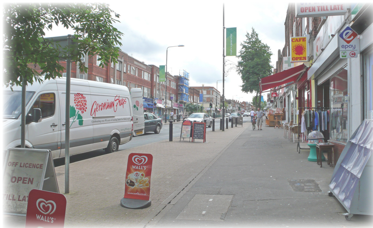
Before - Existing streetscape of Worcester Park High Street