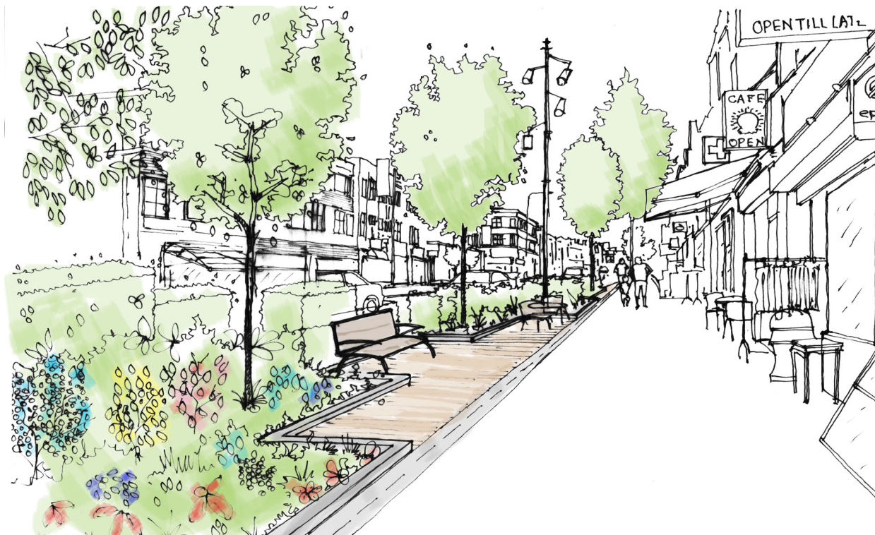
After - Proposed streetscape improvements along Worcester Park High Street