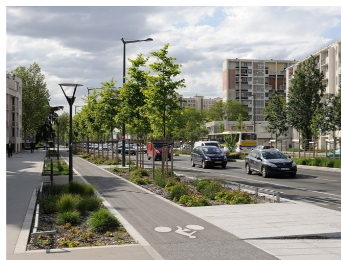
Segregated cycle lane and footway